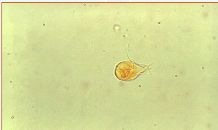
Microscopic view of Giardia , the cause of giardiasis in people and animals

Veterinarians most often diagnose giardiasis after owners notice a sudden onset of diarrhea in their young dog. Infected dogs frequently have a history of being purchased or adopted from places with dense dog populations or a history of being around other dogs or places where other dogs visit (e.g. dog parks).